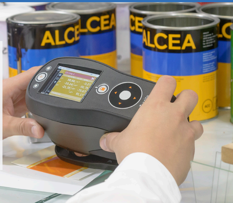
▲ PICTURED: Ci60 taking sample measurements in the lab